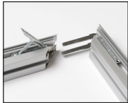
Each frame corner is joined with 4 FastClamps

Frames can be used with single or double sided print. All prices are exclusive of the fabric print.