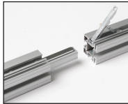
Each length is joined with 1 FastClamp